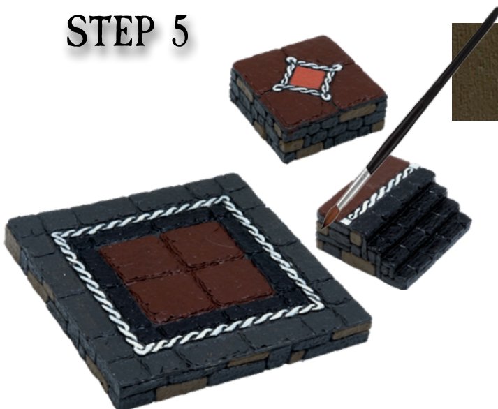
EARTH STONE (GT002-ES)

On the sides of your floors and daises, you'll find dungeon brick detail. The first step to painting these is to fill in the accent stones with Earth Stone using a Pokorny Paintbrush #3.