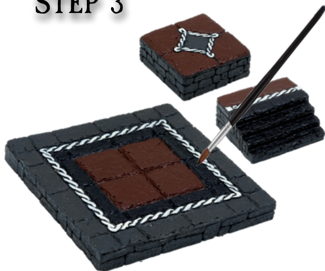
STONE EDGE DRY BRUSH (GT002-SE)

Using Stone Edge Dry Brush and a detail brush, like Pokorny Paintbrush #1, you're going to begin the most detailed step.