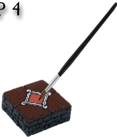
TERRACOTTA DRY BRUSH (GT002-TC)