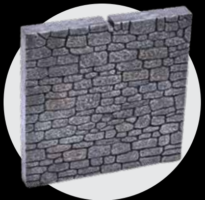
x1 - Solid Wall