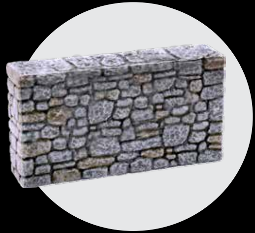
x1 - Wall Spacer