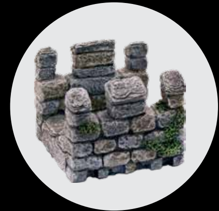
x2- Rampart Crenellation