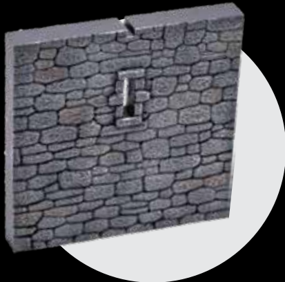
x1 - Arrowslit Wall