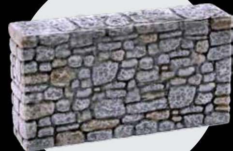
x3 - Wall Spacer