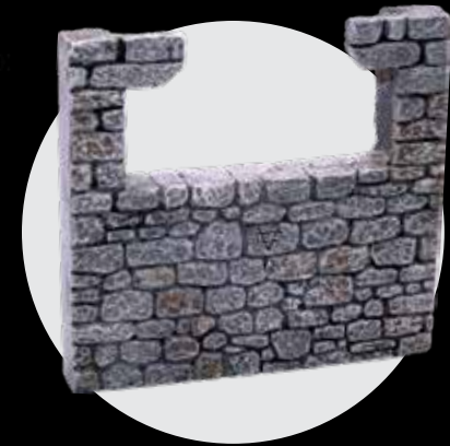
x1 - Insert Slot Wall