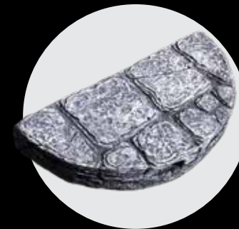
x1 - Tower Half Floor