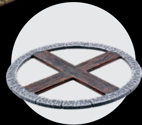
x1 - 4" Tower Roof Platform