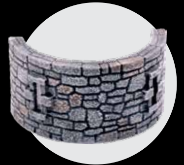
x1 - 4" Tower Half - Arrowslit