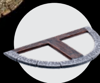
x1 - 4" Tower Half Roof Platform