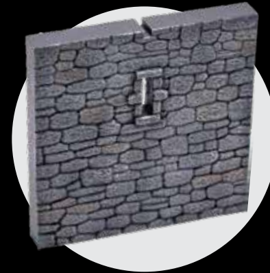
x2 - Arrowslit Wall