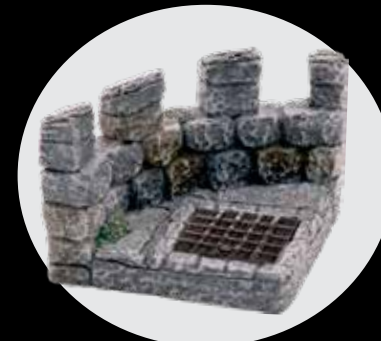
x1 - Small Curved Crenellation x1 - Trapdoor