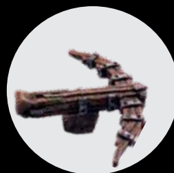
x1 - Arbalest