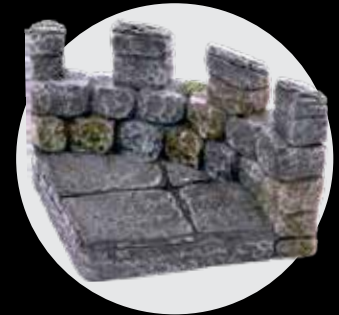
x3 - Small Curved Crenellation