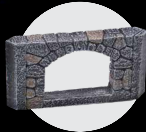
x1 - Arch Wall