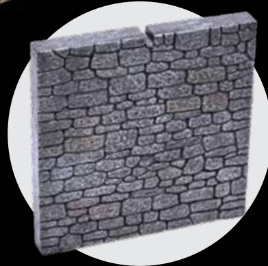
x3 - Solid Wall