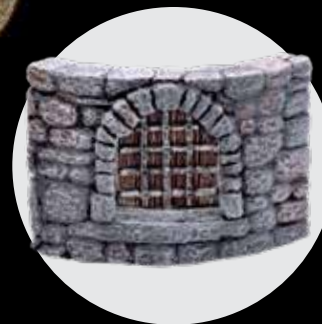
x2 - 4" Tower Doorway Wall x2 - Latticed Door