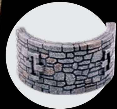
x1 - 4" Tower Half - Arrowslit