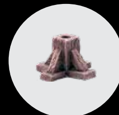
x1 - Wooden Pole Stand