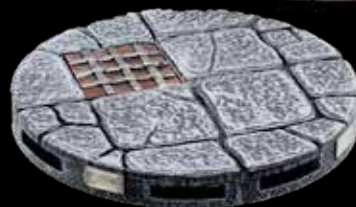
x1 - Tower Floor x1 - Trapdoor