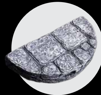
x1 - Tower Half Floor