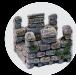
x4- Rampart Crenellation