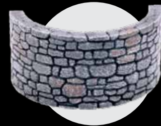
x1 - 4" Tower Half - Solid